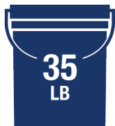
35 Lb Pail